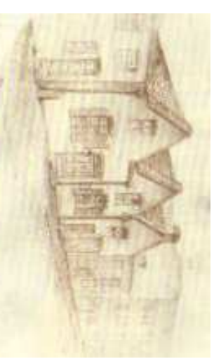
Vicar Lane Meeting House built 1698

A walk around the centre of Coventry visiting places of historic interest and with a special focus on George Fox and the early Quakers and buildings that he would have seen.